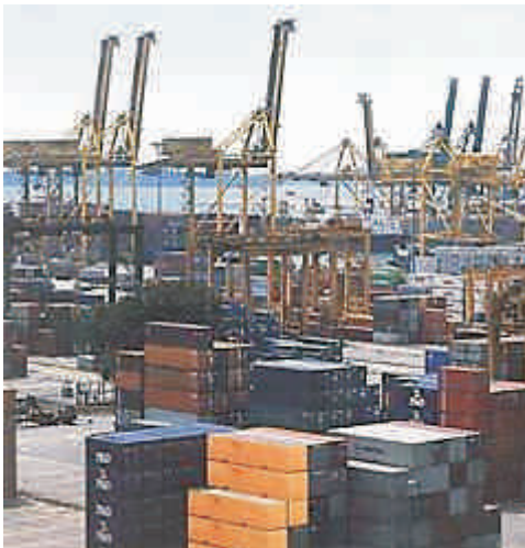
9. LOADING & SHIPMENT

If you want the finest Teak , you have to go where the finest teak grows.